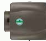
HCWB3-12 Bypass Humidifier 12 gallons per day